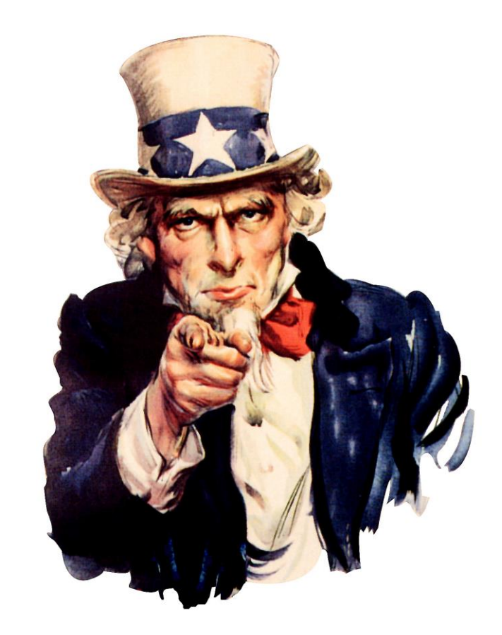
Thanks for all you do!